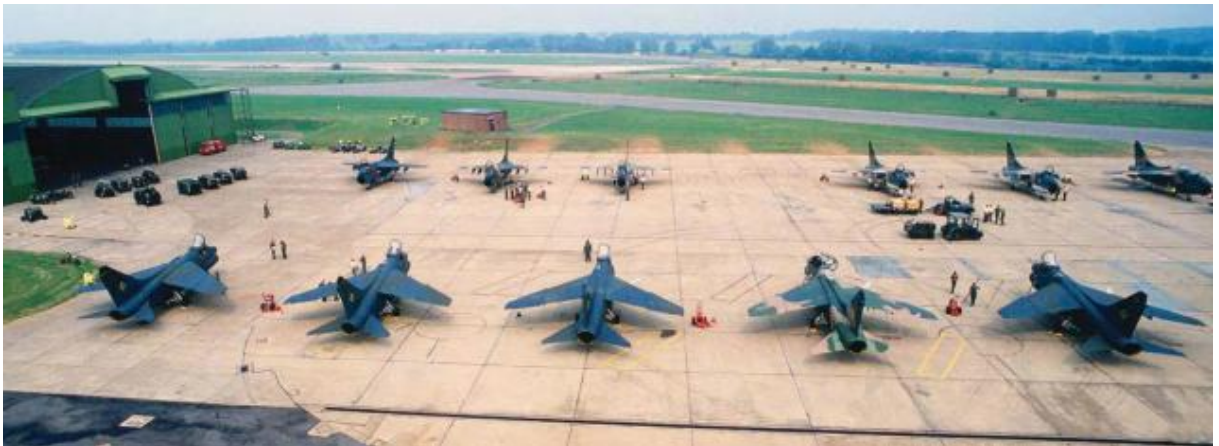
Corsair IIs from 112th TFG, Pennsylvania ANG and 150th TFG, New Mexico ANG at RAF Wittering in July 1983 for Coronet Mail. 1

Tulsa Oklahoma ANG during Coronet Canvas in 1981.