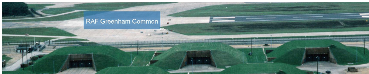
Bunkers at RAF Greenham Common and RAF Molesworth with Tomahawk nuclear armed cruise missiles..