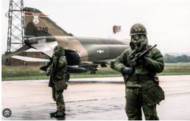
Earlier deployments: 131TFG/110TFS, St.Louis, Missouri ANG F-4D during Coronet Cactus. ix